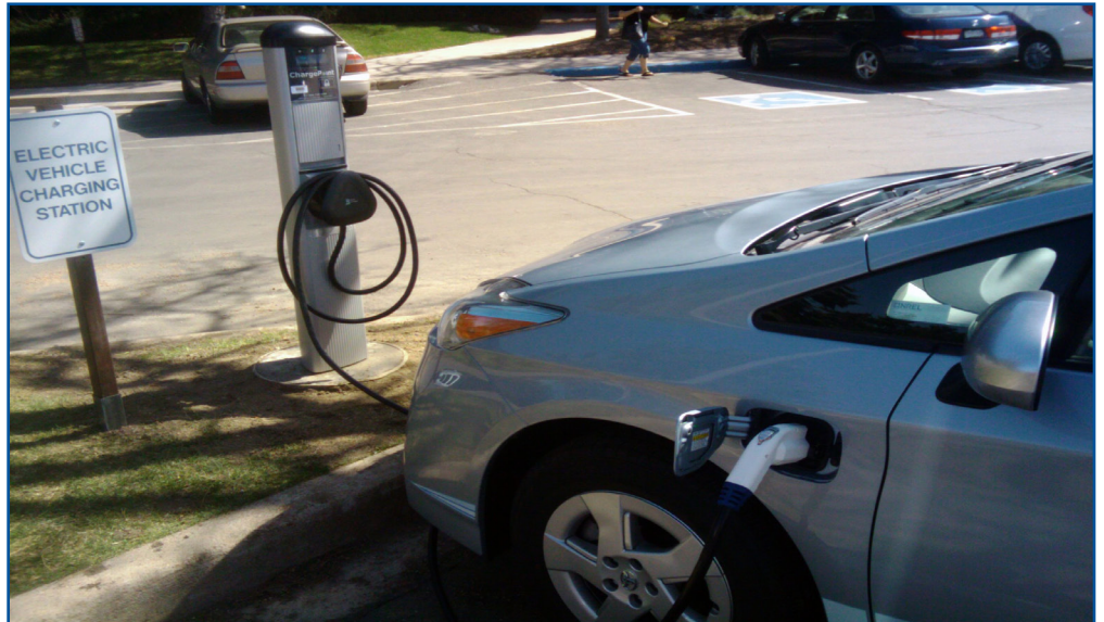
A plug-in electric vehicle (PEV) being charged. PEVs that are battery only can travel about 60 to 120 miles on a full charge; It takes about four to six hours to fully charge a PEV, making workplace stations an ideal solution.