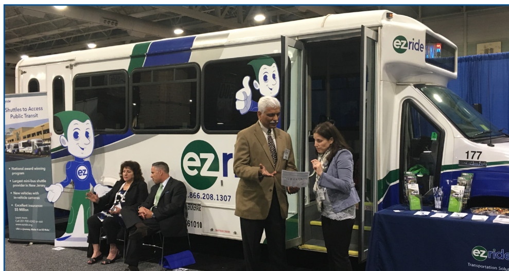
EZ Ride's floor display at the New Jersey Apartment Association Expo in Atlantic City