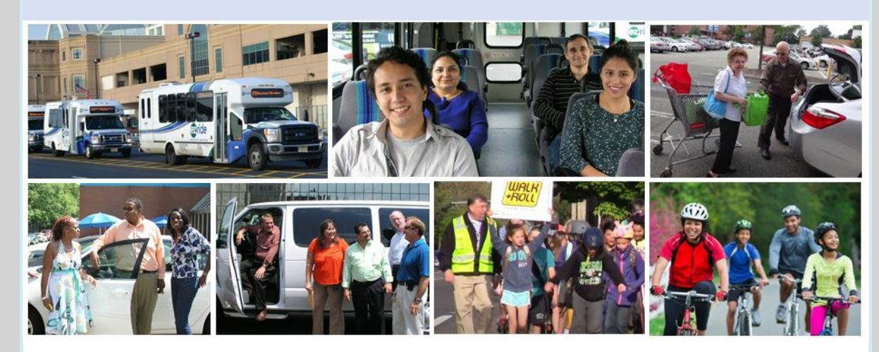
At EZ Ride we believe that a safe, affordable & reliable transportation system is vital to